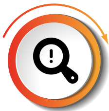
Network Monitoring and Event Detection

You're great at what you do, and you do a lot of things. But watching your network shouldn't be one of them. Your IT team should focus on your strategic initiatives – not making sure your network is operating at peak efficiency. Enter Netrio. Our experienced team leverages operational experience to create an industry first — a completely agnostic approach, adoption of the best tools and applications, workflow automation, and the ability to create a unique experience for each client that delivers a better end-user experience than you could on your own. Which means improved employee satisfaction and production. Happy customers. Lower costs. And more time to focus on growing your business.