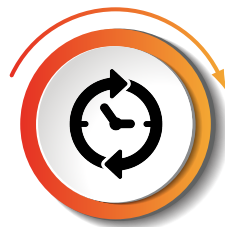
Always Available Phone, Chat, Email